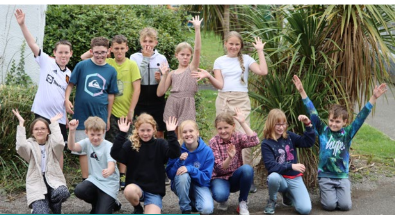
Summer Academy 2022

Interviews to be held: Friday 21st July 2023.