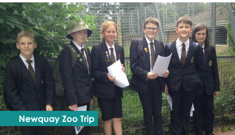
Newquay Zoo Trip