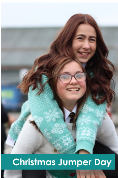
Christmas Jumper Day