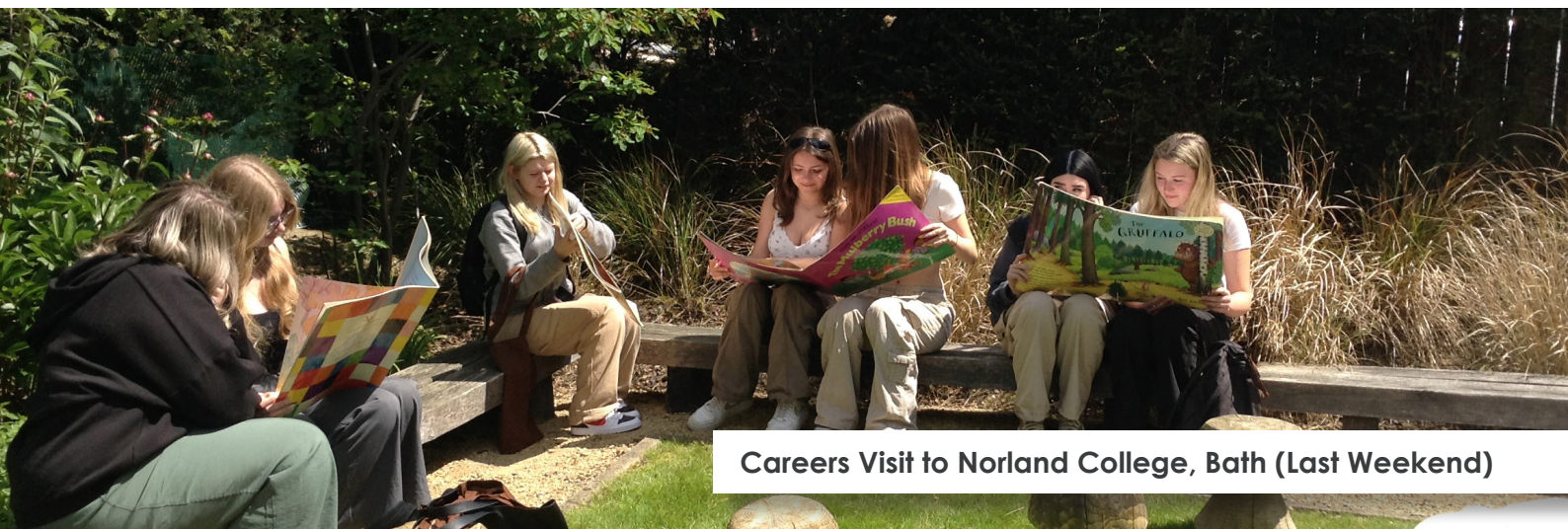
Careers Visit to Norland College, Bath (Last Weekend)