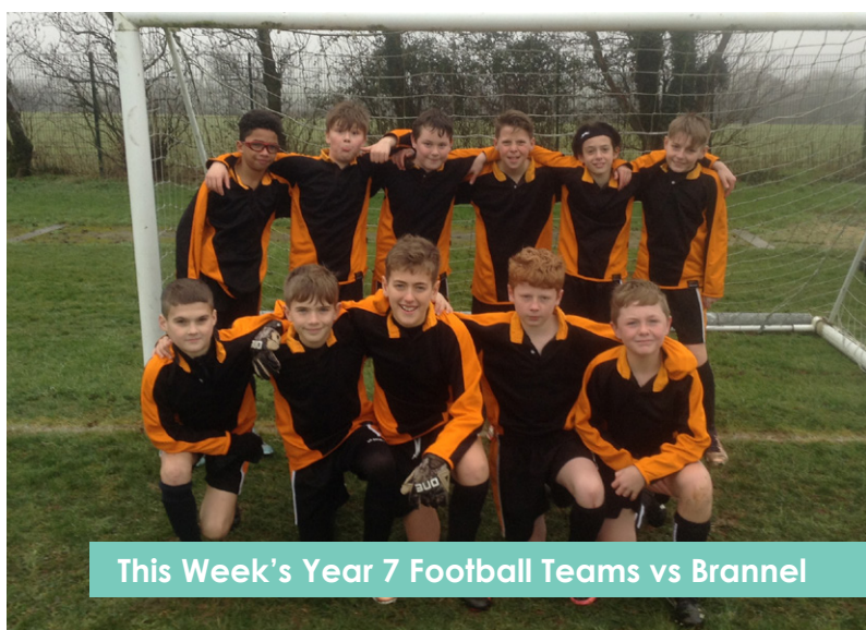
This Week's Year 7 Football Teams vs Brannel