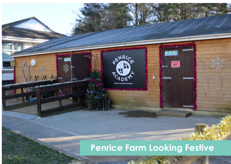
Penrice Farm Looking Festive