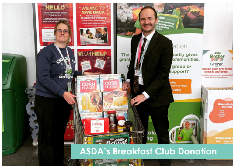
ASDA's Breakfast Club Donation

Buses will arrive for those who normally travel by bus and have a valid bus pass. The new term will begin on Tuesday 3 January 2023.