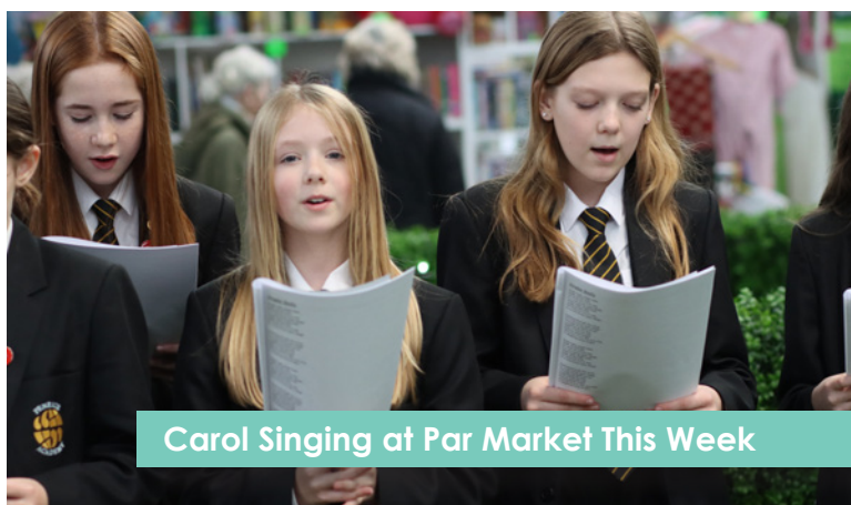
Carol Singing at Par Market This Week