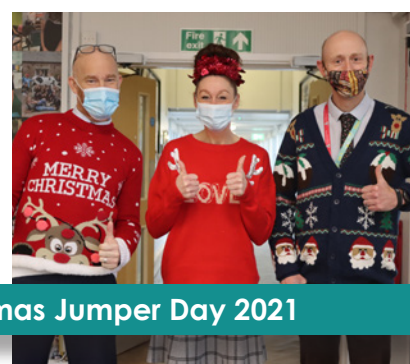
Christmas Jumper Day 2021