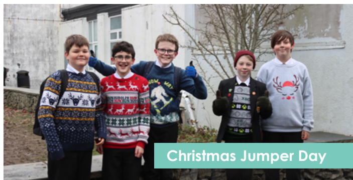
Christmas Jumper Day