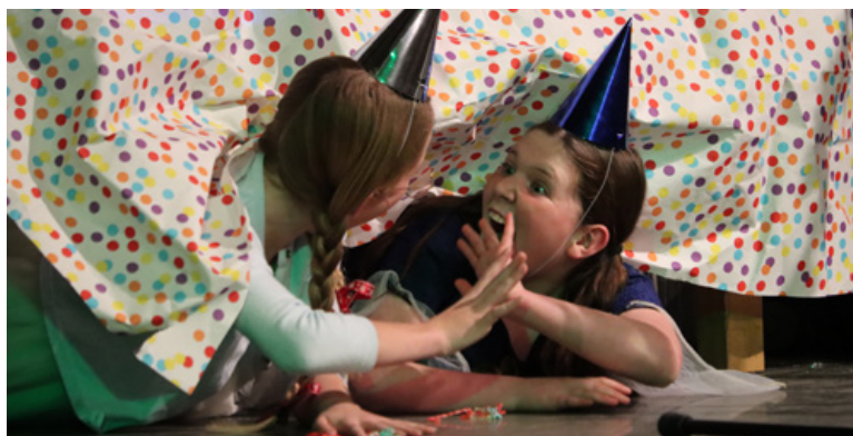
Matilda Jr. Teaser Performance