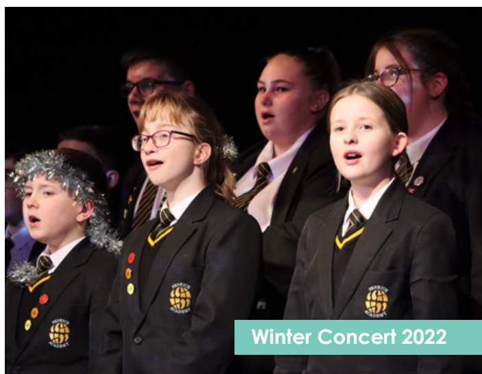
Winter Concert 2022