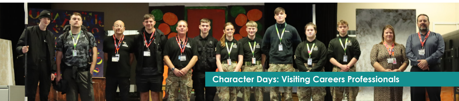
Character Days: Visiting Careers Professionals

Thank you for your patience and we will continue to monitor the situation closely.