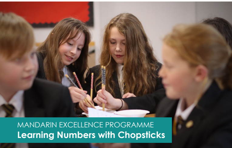
MANDARIN EXCELLENCE PROGRAMME Learning Numbers with Chopsticks

More information can be found on the website's vacancies page .