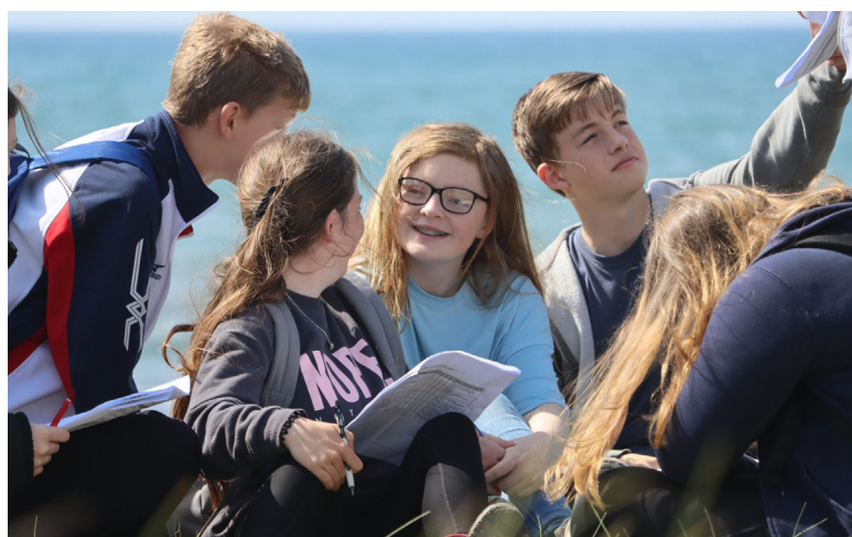
Year 10 Geograph Field Trip on Monday

I am currently visiting each primary school to greet our new starters.