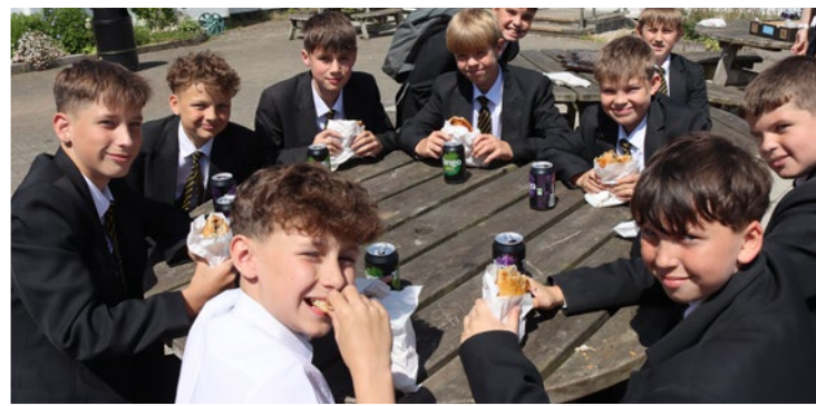
Year 7 & 10 Boys' Football Teams Celebratory Champions Lunch Gathering