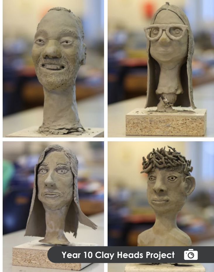
Year 10 Clay Heads Project